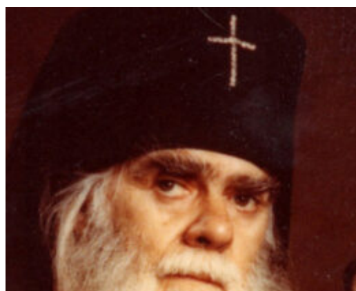
Apostasy in the Orthodox Church Supported by Certain Clergymen and...