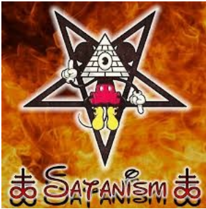
Satanic Mickey Mouse

And that's just a glimpse of my thoughts on Chernabog and Night on Bald Mountain , I hope you enjoy watching the segment in the above link. Let me know YOUR thoughts in the comments below.