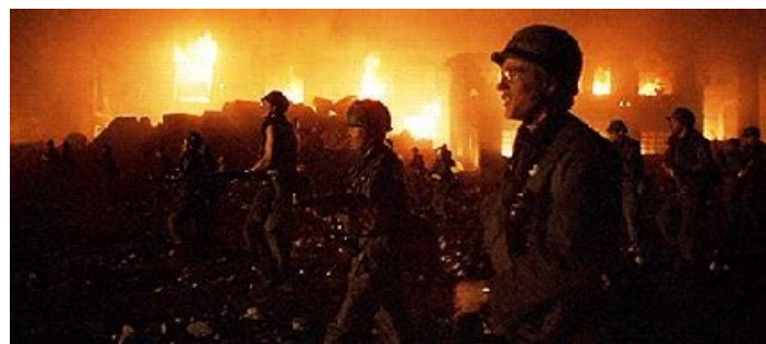
Full Metal Jacket Mickey Mouse Song

„It's a big club. And you're not in it.“