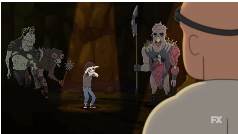
Little Demon